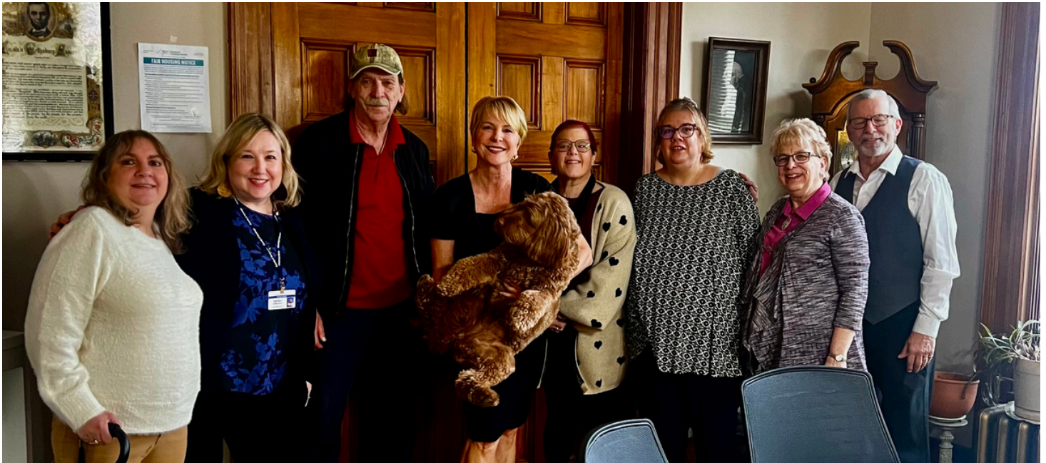
SCCCMH Board Members sharing the legislative Agenda with Assemblywoman Mary Beth Walsh

The 2026 Legislative Agenda calls for immediate action to strengthen New York’s mental health system through strategic investment in workforce stability, early intervention, and crisis response. A 2.7% funding increase for community-based, not-for-profit human services in the FY 2026–2027 state budget is essential, as the proposed 1.7% falls short of addressing critical staffing shortages fueled by demanding work and inadequate wages.